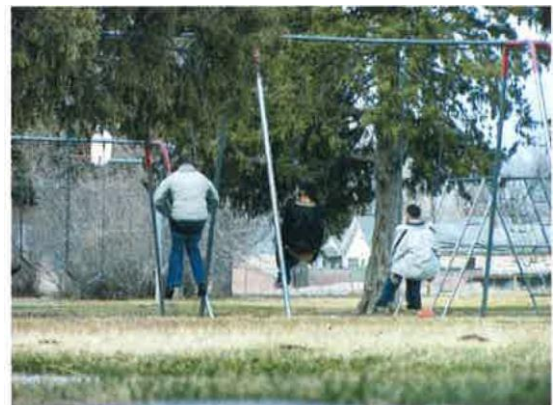
Outdoor playground and Basketball Courts

Trips to parks and attending community events are frequent. In the past, groups have gone to Cheyenne Frontier days, University of Wyoming football and basketball games, and Colorado Rockies, and Denver Nuggets games. Occasionally, there are plays and dramas performed by those wishing to participate and events to attend in the community.