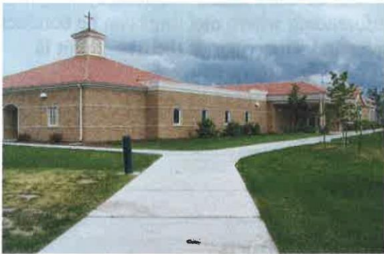
Sisters of St. Francis Children's Center

There are five living units on campus. The Sisters of St. Francis Children's Center and Bosco Center each houses two units. The Newell Center is the secure unit on campus that houses boys and girls of all ages that require closer supervision and restrictions due to more serious behavior problems. It is intended to be for a short time and then the child moves to one of the other living units.